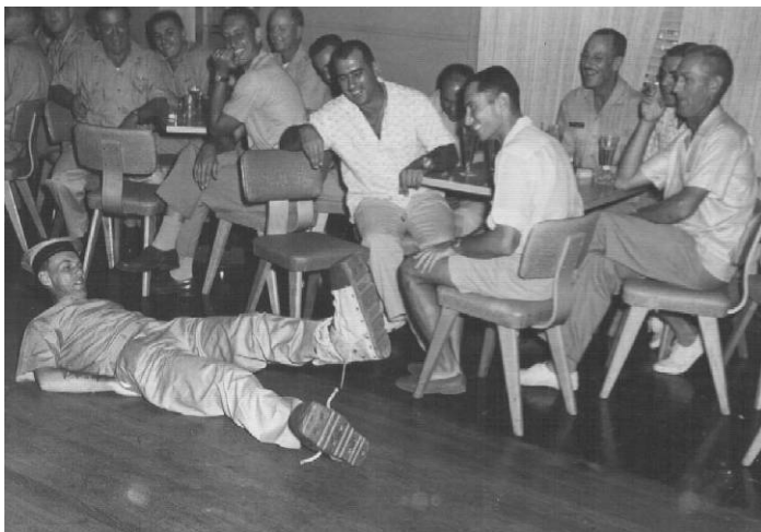
Making chief has its good points and bad points.