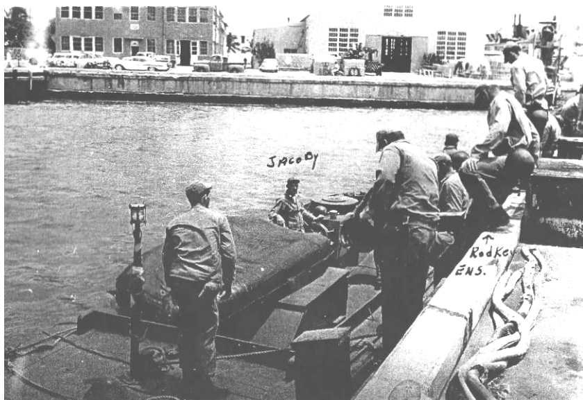
Trip to Demo Island April 1958 – sent by Art Dahlgren